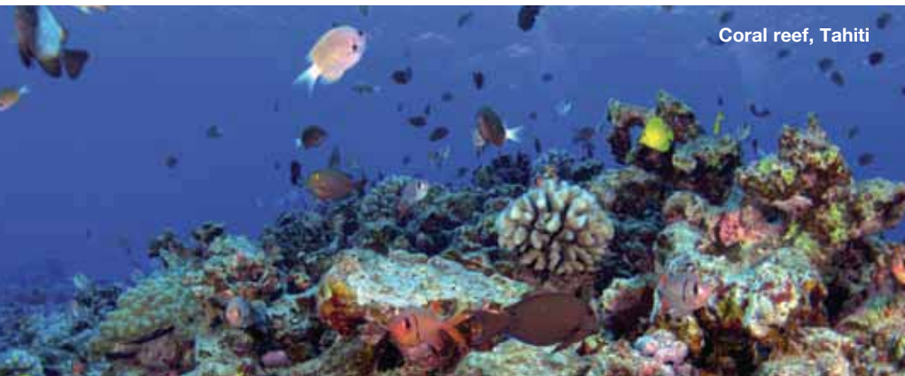
Coral reef, Tahiti