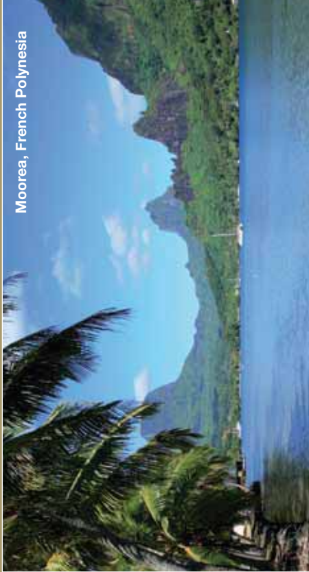
Moorea, French Polynesia

bon appetit culinary center Aboard Marina