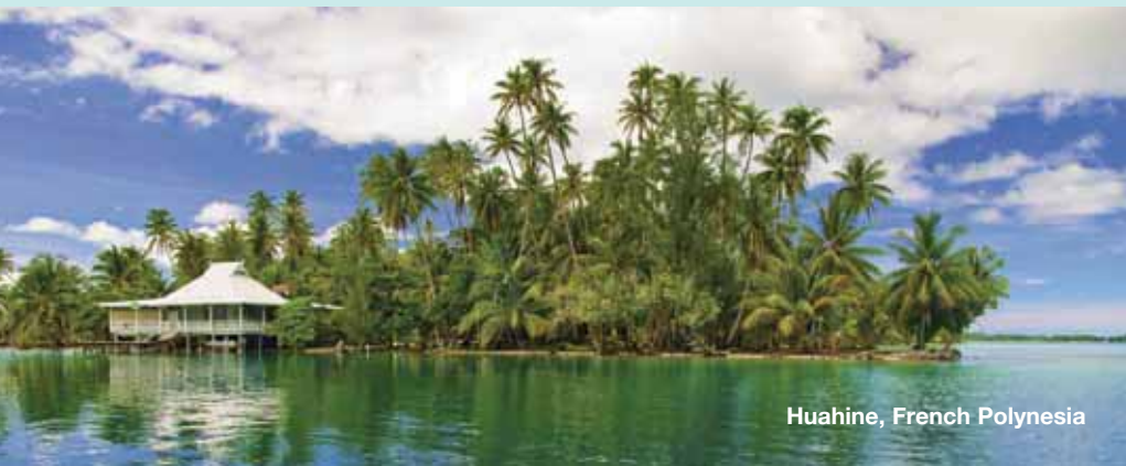
Huahine, French Polynesia

The agreement in this brochure is the exclusive and entire statement of the agreement between you and Go Next, Inc. It should be read carefully.