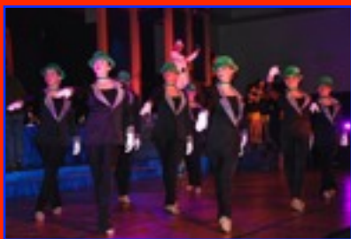
Celebrate America Dancers