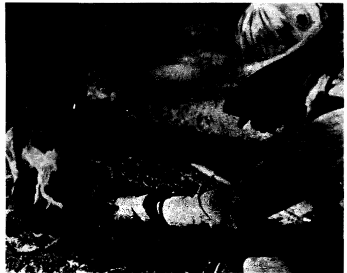
Figure 3 —Smoldering peat moss generated bark surface temperatures of up to 500 °C.

The blocks were revisited in May 1993 to assess the results. Mountain pine beetle infestation between ground level and 2 m high on the trunk was estimated by two methods. Light attack densities (unsuccessfully attacked trees) were estimated by counting attacks over the entire lower 2 m of the tree trunk and dividing by the surface area to obtain the number of attacks per dm 2 . Egg gallery density was estimated by measuring the length of up to five galleries, taking the average length, and multiplying by the attack density. Heavily attacked trees (mass attack, strip attack, and a few unsuccessful attacks) were sampled for attack and gallery densities by removing two 231-cm 2 areas of bark and counting attacks and measuring galleries. Samples were taken from different sides of the tree, or on the same side when only a narrow strip of bark was successfully infested (fig. 4). Trees were classified