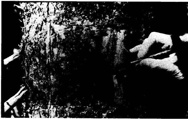
Figure 4 —Infested lodgepole pine sampled for mountain pine beetle attack and egg gallery densities.

into four categories: (1) unattacked; (2) unsuccessfully attacked—light attack density and low gallery density with galleries invaded by pitch, preventing successful brood production; (3) strip attacked—vertical strip of bark was attacked at sufficient density to ensure some beetle brood survival; and (4) mass attacked—entire circumference of the lower trunk attacked, brood present, tree dead. The term “pitch-out” is frequently used in a way that is misleading. If a tree pitches the attacking beetles out, it is considered too vigorous for them to overcome. However, the reason for most pitch-outs is not high tree vigor but low attack and gallery densities. We use the less confusing term “unsuccessful attack” in this paper.