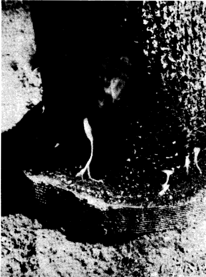
Figure 2 —Duff was cleared away from base of the tree and replaced by peat moss held by hardware cloth to obtain more uniform heat injury.

To ensure that beetles would be attracted to the block, mountain pine beetle bait (Phero Tech Inc., trans-verbenol, exo -brevicommin, and myrcene) was placed in the block. Our intent was to attract beetles into the block. They could then discriminate among treated trees for infestation. Baits were attached to the top of metal fenceposts 1.5 m above ground level. These baits were 3 to 5 m away from treated trees. Had the bait been put directly on a tree, that tree would almost certainly have become the focus of infestation. The number of baits used per block varied according to spacing of treated trees. No treated tree was to be farther than 5 m from a bait. Two baits were usually used, but sometimes three were needed. Blocks were widely distributed, but had to be at least 30 m apart to ensure that a large population of beetles in one block would not “spill over” into an adjacent block. Five blocks were placed in each of four areas: east side of the upper Salmon River, west side of the upper Salmon River, Frenchman Creek, and Smiley Creek. The distance between blocks ranged from 30 m to 2 km. The forest adjacent to each block contained three to six trees that were infested in 1991.