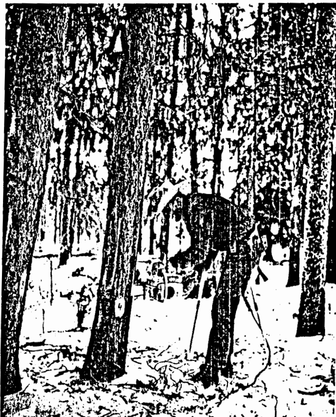
Figure 1.--A chain saw was used to cut vertical slots in trees for film placement.

For purposes of comparison, two 15.2-cm 2 areas of bark within 31 cm of breast height were removed from the trees each time populations were radiographed. All insects, mountain pine beetle egg galleries, and gallery starts in the samples were counted. Plastic screen cages also were stapled on the trees in this area to collect insects emerging from the bark.