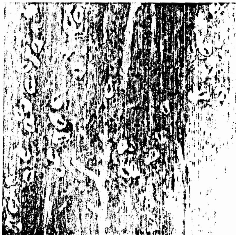
Figure 3.--Radiographs of good quality can be produced where moisture content of wood and bark is uniform and a filter is used to prevent overexposure of thin areas.

2 Beetles could not be sexed because of broken abdomens.