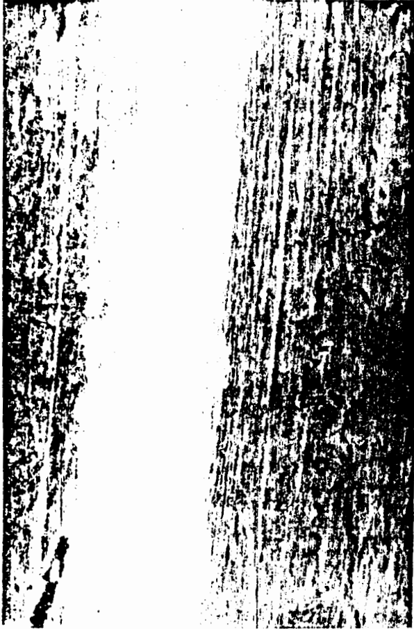
Figure 4.--Radiographs of poor quality result when moisture content of wood and bark is not uniform. Light streak represents area of high moisture content, the result of unequal distribution of bluestain fungi.

The radiographic method does not appear to offer any clear-cut advantage over the bark-removal method of sampling field populations of mountain pine beetles at this time. Although estimates of live beetle numbers obtained by the two methods were comparable, disadvantages of the radiographic method should be taken into account. These are (1) costs of both time and material; (2) difficulty in detecting dead beetles on radiographs and in assessing specific causes of mortality; and (3) lower emergence of brood adults, but higher female survival rates in radiographed areas.