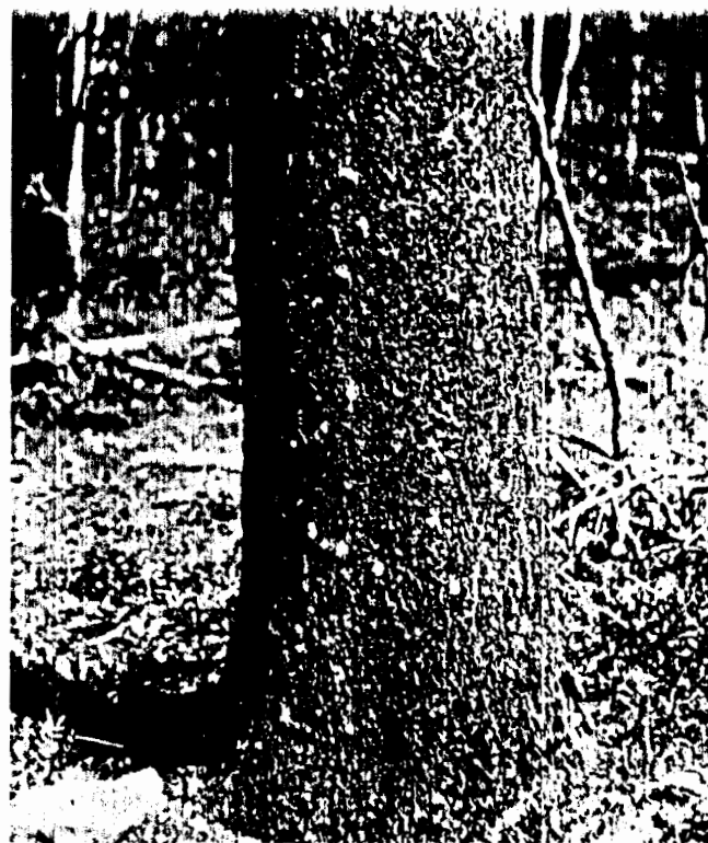
Pitch tubes and sawdust traces provide evidence that beetles have entered trees.

supply before the beetle becomes excessively active within the stand.