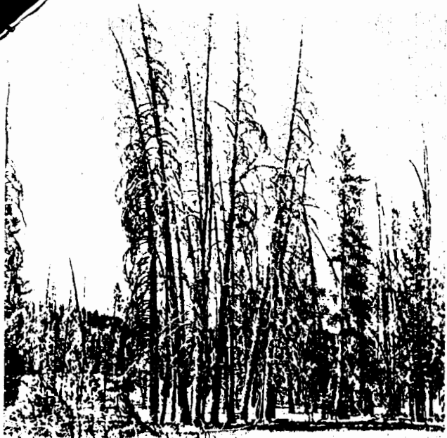
Lodgepole pine devastated by the mountain pine beetle (Teton National Forest, Wyoming).

trees are killed. Unchecked, group infestations can expand with each new beetle generation, and eventually large areas may suffer extreme losses of forest cover.