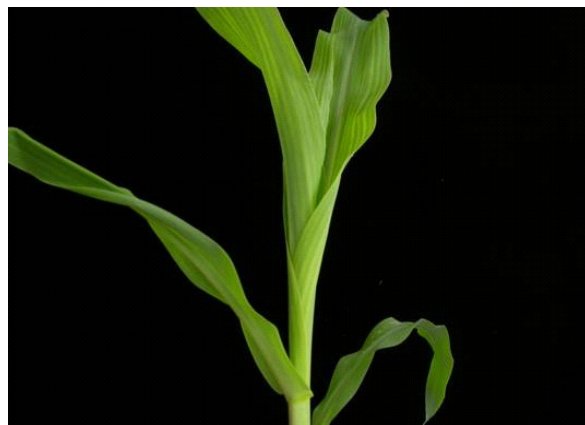
GOLD'n GRO -treated plant.