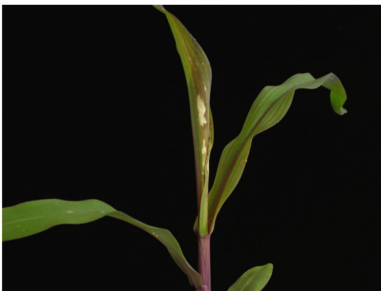
Zn-deficient control plant.