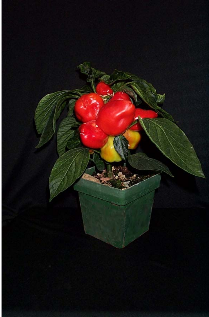
'Triton' fruit turn bright red when mature. In this photo, the peppers are about 80 days old. Each plant produces about 6 to 8 fruit.