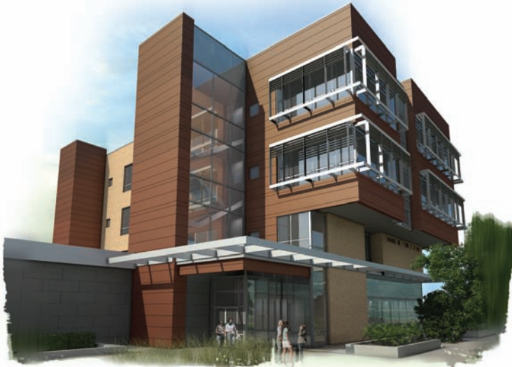
RCDE, image courtesy VCBO Architecture