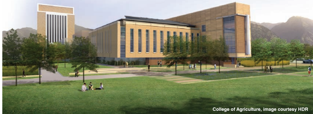
College of Agriculture

Construction is under way for the new College of Agriculture building, to be located on a prominent site east of the Quad and will replace the existing Ag Science building, which has outlived its useful life. The project will be approximately 121,000 square feet and is funded by the state of Utah.