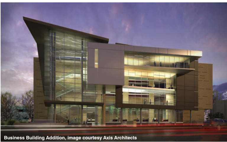
Business Building Addition, image courtesy Axis Architects

A new building to house RCDE offices and state-of-the-art distance education classrooms has begun construction on a convenient, central location along 100 North. It will enable USU to deliver high-tech education and quality academic programs to students in Logan, throughout the state, and around the world. Classes will be provided online, face-to-face, as well as through interactive video broadcast.