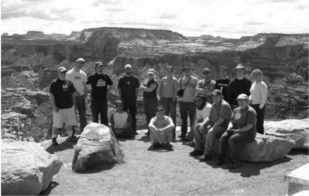
Photo taken from the Spring 2004 Geology 2500 Trip in the San Rafael Swell.

UtahState UNIVERSITY Department of Geology 4505 Old Main Hill Logan UT 84322-4505