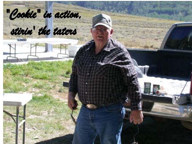
"Cookie" in action, stirin' the taters