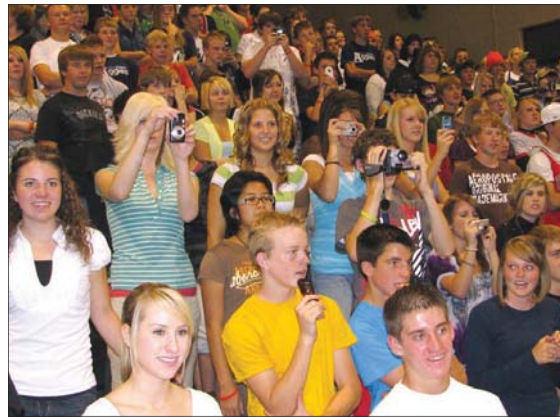
Students watch and photograph singer Jessica Simpson at Weber High School on Monday.