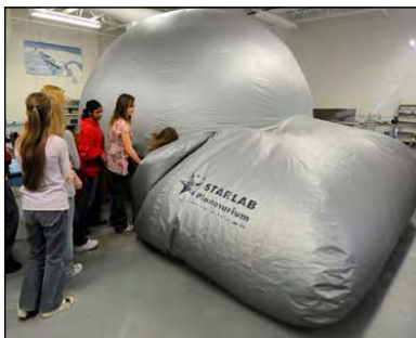
Students enter the Cache StarHouse at the South Cache 8-9 Center on Wednesday.

The star house is an inflatable dome, about 12 feet high and 15 feet in diameter when full. A fan keeps a steady flow of air entering the dome through a short tube and people