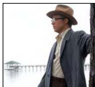
Brad Pitt is shown in a scene from "The Curious Case of Benjamin Button."