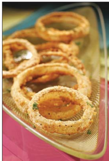
About one in five consumers say ordering fried food is done on impulse and 32 percent said they chose it at restaurants because they don't normally make it at home.