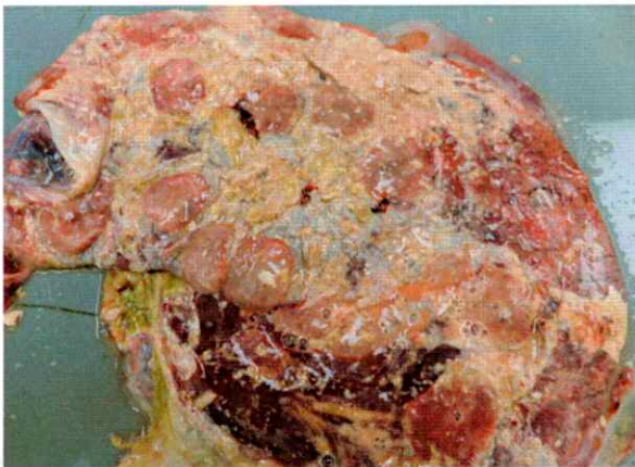
Figure 1: Placenta from animal who tested positive for Q fever.

There are a variety of testing options available including immunofluorescence test, ELISA, complement fixation test, PCR, and culture. Samples that are typically accepted include stillbirths, placenta, vaginal discharge, milk, and aborted fetal tissues, but other samples can be appropriate. Discuss with your veterinarian, or submitting laboratory, about what samples to take and how before submission. Unfortunately, there is no true treatment in the US at this time. Although some sources note antibiotic treatment as an option, the efficacy remains undetermined. Since it is a reportable disease within the state of Utah, it must be reported to the state veterinarian and options to control disease spread will be discussed.