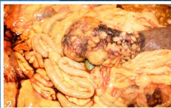
Figure 2: Spleen with white mass attached