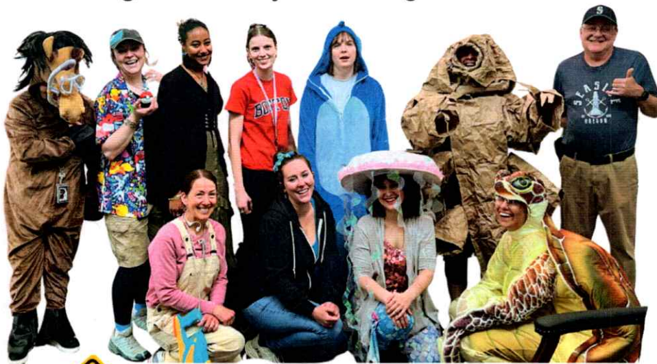
UVDL Staff Members

In honor of National Lab Week, 4/19 – 4/25, we celebrated the hard work and dedication of our team through nautically themed games and activities.