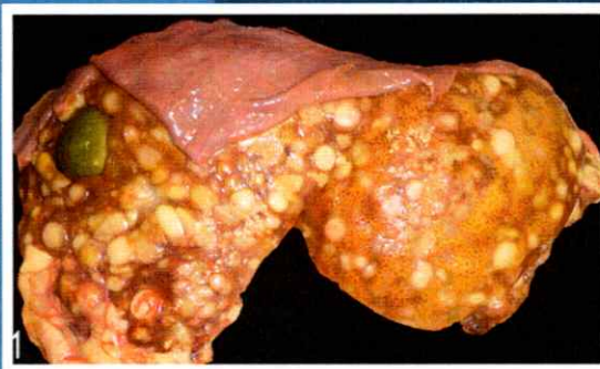
Figure 1: Affected liver with multiple nodules

In this case, the splenic mass was likely the primary lesion that later disseminated to the liver. Disseminated histiocytic sarcoma was the cause of lethargy, hyporexia, and ultimately death observed in this dog.