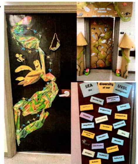
UVDL Decorated Doors