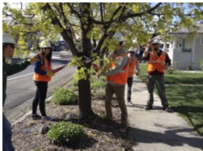
Living with Wildlife Students, participating in the Citywide Tree plan project.

Universities: Universities routinely express a desire to be both interdisciplinary and relevant. CBI presents a new model to meet these needs. CBI embodies the University's mission of serving the public good in its position as a public institution of higher education.