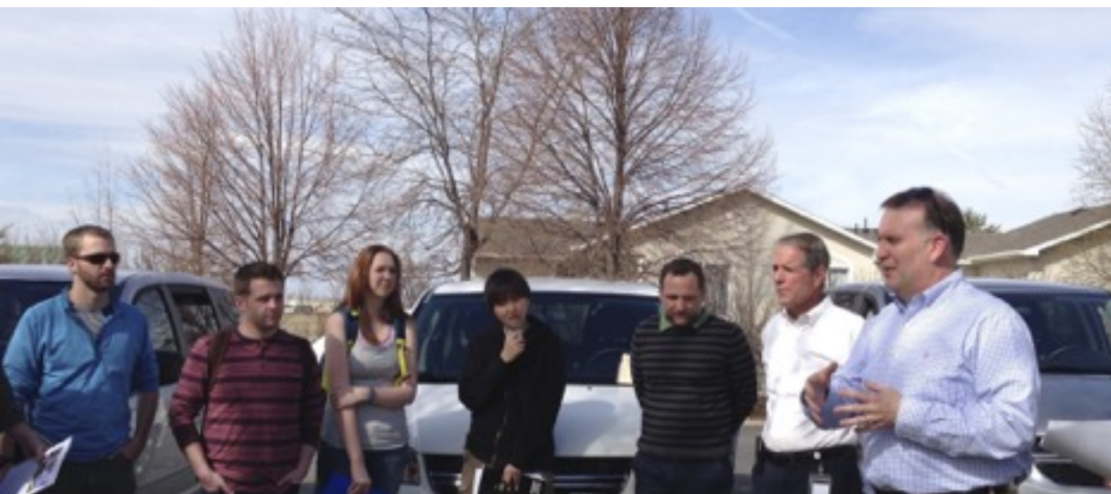
LAEP Students participating in the Land Planning for Residential Development project