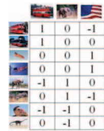
Fig. 1: Illustration of semantic clusters and semantic features

two images as positive (marked by 1's) and two images as negative (marked by -1's) for each query. Each column stores the query's semantic information learned from the user's RF. All positively labeled images in a column form a semantic cluster. Each row corresponds to high-level semantic features of an image. It clearly shows that the dimensionality of high-level semantic features grows as more queries are performed. For example, the high-level semantic features of the first database image are (1, 0, -1) after performing three queries.