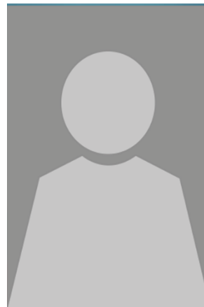
Student Involvement Office involvement@usu.edu 435.797.2912