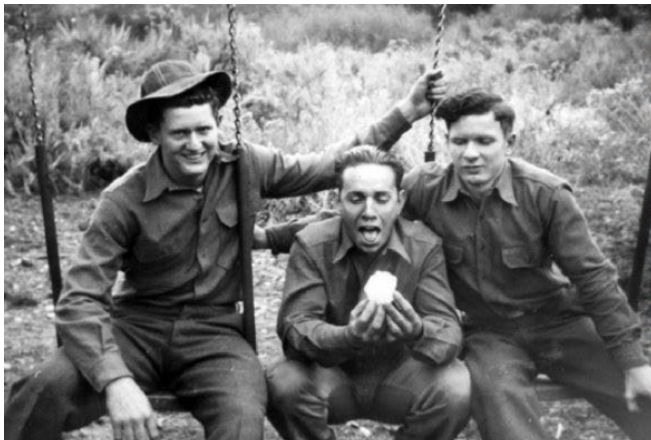
Civilian Conservation Corps | Zion NP | 1930

The UCC proudly follows in the footsteps of the Civilian Conservation Corps (CCC) while expanding the national service tradition to wider audiences as a 21st Century Conservation Service Corps. UCC began when a group of committed citizens formed a steering committee in the fall of 1999 and wrote a successful AmeriCorps grant proposal in the winter of 2000. The UCC began operation at Utah State University's Outdoor Recreation Center with its first group of AmeriCorps members in January 2001. The early focus was on traditional, hands-on conservation, like trail and fence building & maintenance, habitat restoration, and scientific surveying. Over the years, we've expanded to include environmental education, specialty crews, disaster response, urban farming, and food security.