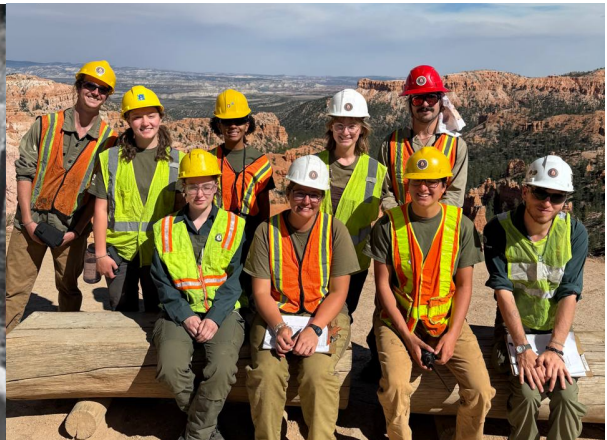
Utah Conservation Corps | Bryce Canyon NP | 2025